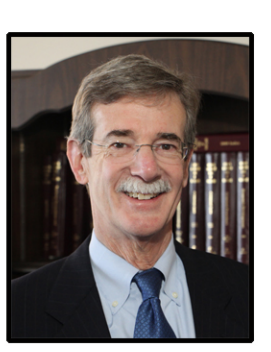
Brian E. Frosh Attorney General

Maryland Office of the Attorney General 410-576-6300 1-888-743-0023 toll-free TDD: 410-576-6372