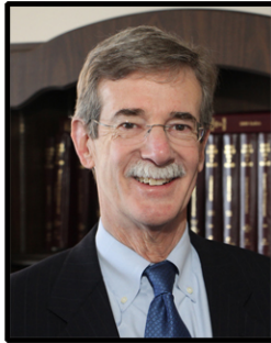
BRIAN E. FROSH ATTORNEY GENERAL

MARYLAND OFFICE OF THE ATTORNEY GENERAL 410-576-6300 1-888-743-0023 TOLL-FREE TDD: 410-576-6372